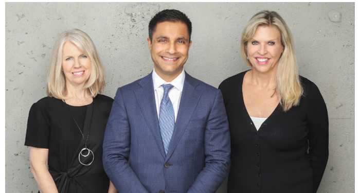
Gill Wealth Management Group TD Wealth Private Investment Advice